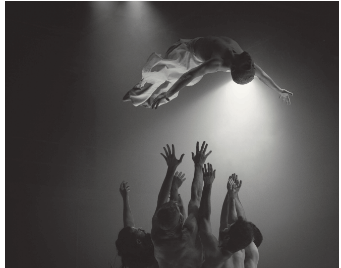
1) Rhiannon Giddens in concert | Spring 2024; 2) Compagnie Hervé Koubi | Spring 2024