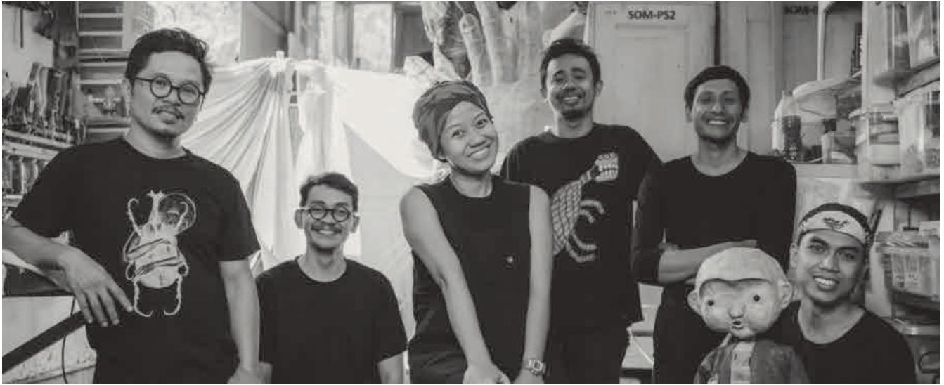
Members of Papermoon Puppet Theatre in their Yogyakarta studio workshop.