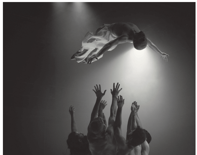
1) Rhiannon Giddens in concert | Spring 2024; 2) Compagnie Hervé Koubi | Spring 2024